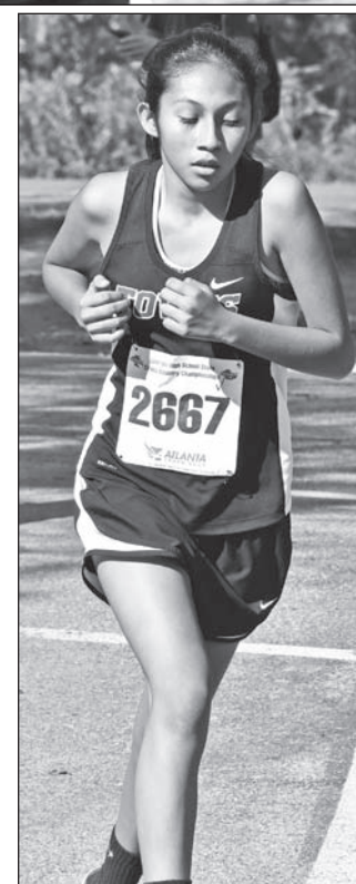
The Towns County Lady Indians Cross Country team in action last weekend in Carrollton for the Class A Public State Championships.