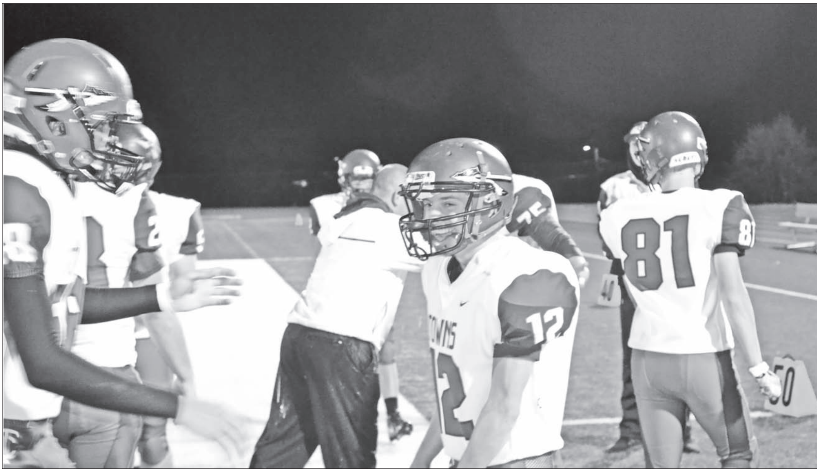
The Towns County Indians celebrate their season-ending victory at Providence Christian Academy.